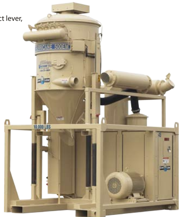
Dimensional Drawing On Reverse Side